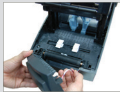
Auto-Cutter : Easy installation